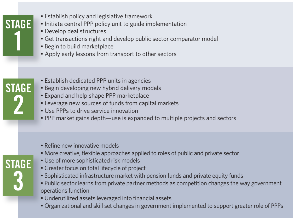
FIGURE 2: STAGES OF PPP MATURITY

While PPP has been in use as an officially defined concept since the 1990s, its application has been patchy and inconsistent across jurisdictions. The U.K. has been at the forefront of PPP use, and led its development through policy and experience—no country comes close to its number of projects. There is, however, a difference between the number of PPPs that a jurisdiction undertakes and the maturity of its PPP market. The maturity of a market refers to the sophistication of its PPP mechanisms and is judged through its understanding of PPP as seen through its framework and models, and is influenced by contextual factors such as political climate, culture, capital markets, or policy framework. The following figures suggest three stages of PPP maturity and indicate the relative maturity of various jurisdictions from around the world in the form of a Market Maturity Curve.